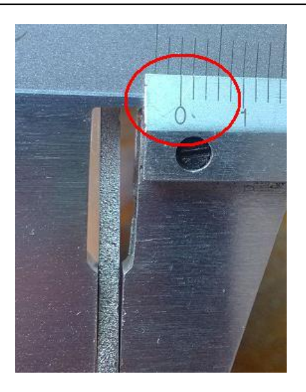
The wall mount back board is made in 304 stainless steel, thickness at 2mm