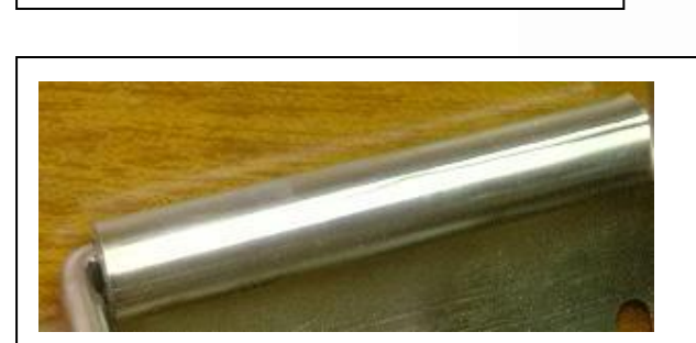
The dispenser can be folded in small volume by flexible spindle