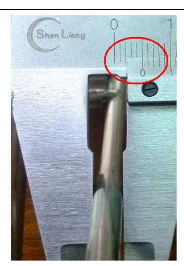
Strong lever with diameter 5mm, made by 304 stainless steel.