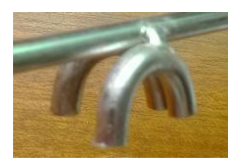
The claw fasten the top of the bottle & press it to let gel out