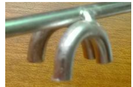
The claw fasten the top of the bottle & press it to let gel out