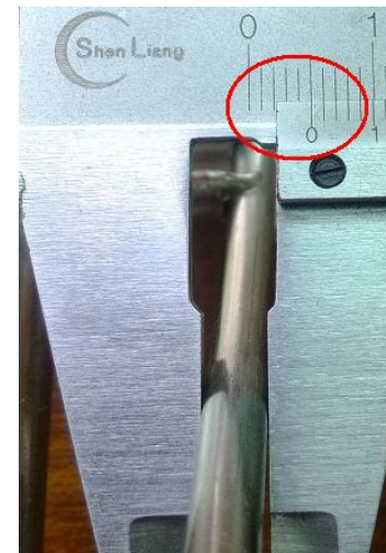
Strong lever with diameter 5mm, made by 304 stainless steel.