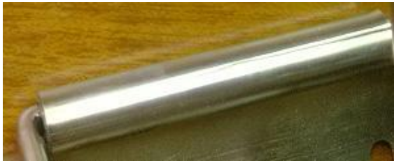
The dispenser can be folded in small volume by flexible spindle